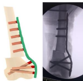
Figure 3: 3D virtual planning of the femur with the plate bending and fluoroscope image post-surgery.

The fitment of the guide on the distal medial femur was accurate. The correction achieved after the surgery matched with the values in the virtual surgery planning. Fig. 3 also shows the fluoroscope image of the correction in conjunction with the virtual planning done for a patient showcasing the accuracy of the 3D surgical plan and guides.