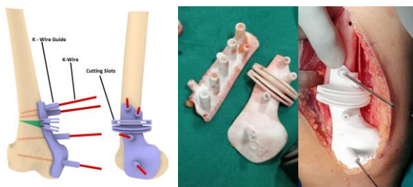
Figure 2: CAD model of the patient specific guide and the 3D Printed guide for a 15 year old patient with wedge marked.

(LCP) is also imported into the CAD software along with the screws. The plate is aligned with the corrected anatomy and is bent for best fit. This provides the right plate orientation and screw length required for the surgery. A bone's surface is created in a CAD software which acts as a base model to design the guide. The cutting plane is defined at the tBT and cutting slots are provided keeping in mind the dimensions and the vibrating factors of the osteotome. The drill guide structures are created along the screw axis. K-wires are carefully inserted making sure it does not intersect with the screw holes and the cutting plane, as well, does not come in between while performing the osteotomy or drilling the screw holes. The K-wire guide structures are created. Overall thickness of the guide is provided to ensure stability and strength.