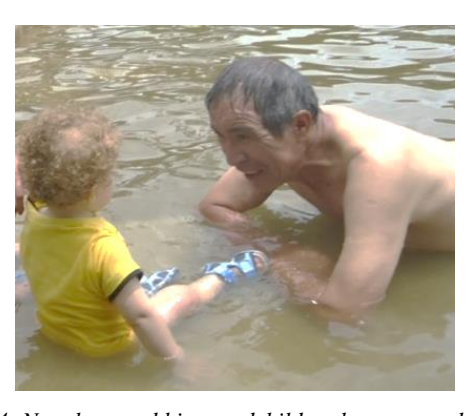
Figure 4: Napoleon and his grandchild at the years-end of 2011.

But not just for him but for all related cases it always is the question if the result is enduring. Therefore, it was great news, that approximately 10 years later, at New Years Eve of 2020, Napoleon was dancing with his daughter. Dancing is a hard test for his mental and musculoskeletal system – indeed he is dancing into his second life.