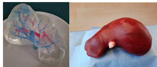
Figure 1: Liver phantom in 50 % scale with transparent tissue material showing embedded blood vessels (left). Liver phantom with opaque tissue material (right).

compatible with a HF-device required a certain water content in the material. Standard UV-curable plastics lack those features. Therefore, we decided to apply a hybrid approach combining collagen-based casting and 3D-printing.