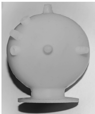
Figure 2: Urinary bladder model made of silicone with connections for thermocouples and venting on the surface.

The proposed method successfully produced an elastic urinary bladder made of silicone (Fig.2).